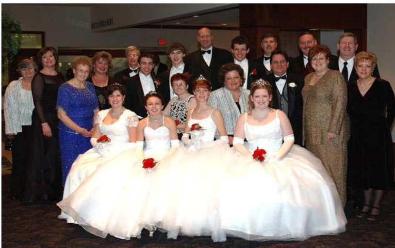
2006 Viennese Strauss Ball

....We would like to ask our current members to contact old members and encourage them to attend the monthly meetings and our fests.