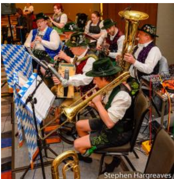
Two great bands — our own Siasswasser Tanzlmusi (above) and Ochsenschädl Musi (below) — alternated playing. Our musicians loved the opportunity to dance.