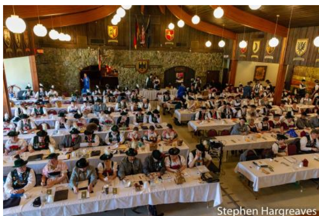
The picture on the left is of the main hall of the German-American Society building. It's a huge building with several different halls, rooms, and a Rathskeller. It is home to 11 separate German organizations. The food is excellent as is the hospitality.