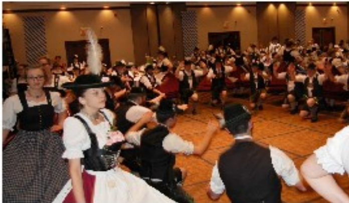
The "Gauplattler" included dancers from all over.