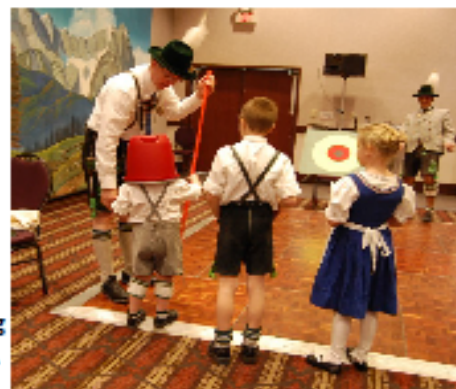
The kids loved the Bockstecken game. Who wouldn't like to put a bucket on their head, spin around, then aim a broomstick at a target?

As it neared time for the evening banquet, people