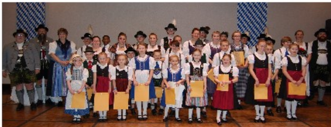
The 33 children 5-17 who participated in the dance exhibition and competition, along with the judges and those who run the dance event.